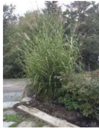
Miscanthus zebrina in PEC MG Barbra Stock's garden