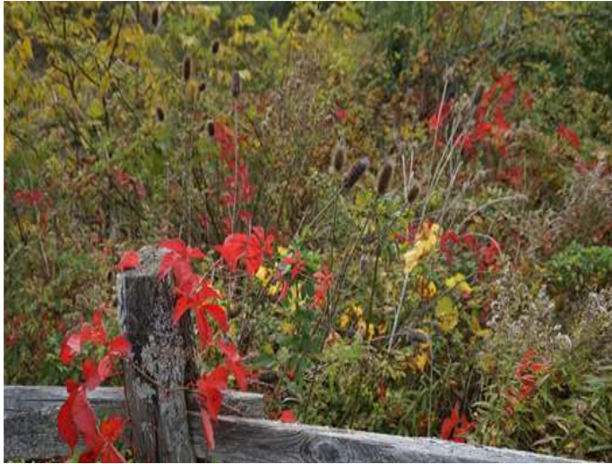
Newsletter of the Master Gardeners of Ontario