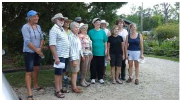
Grey County Master Gardeners