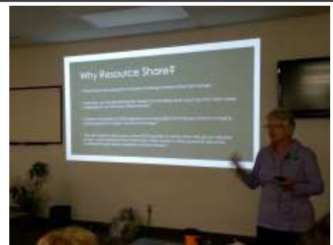
“Resource Sharing” generated a lot of enthusiasm!