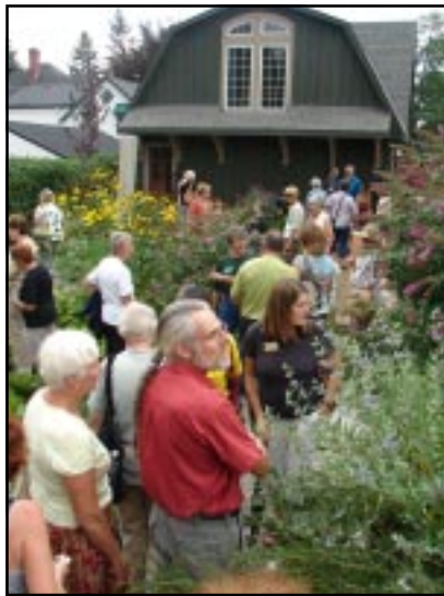
Garden tours were the highlight of the afternoon at the Niagara Technical Update in August

The action plans of your board over the next 12 months are as follows: