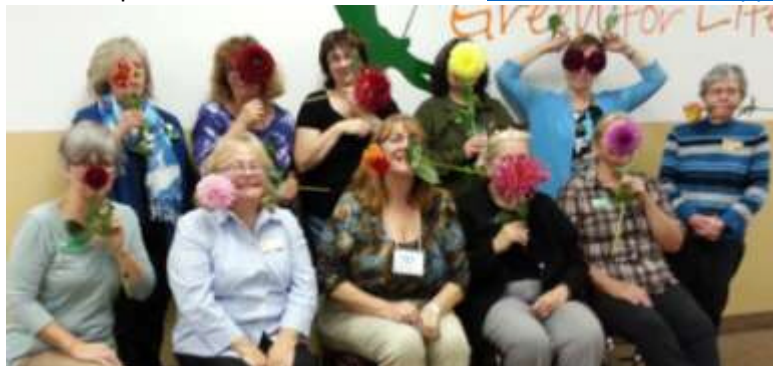
During lunch we posed for sensible and silly photos.