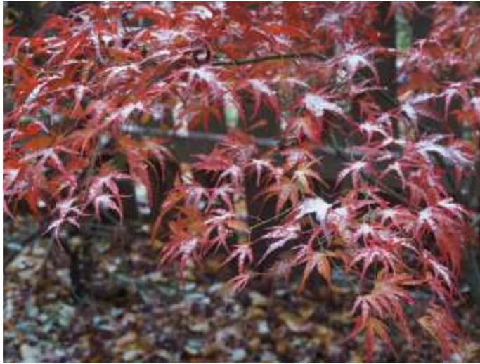
Newsletter of the Master Gardeners of Ontario