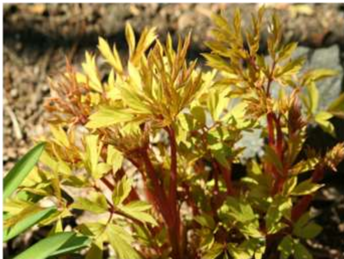
Newsletter of the Master Gardeners of Ontario