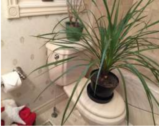
Plants being potty trained - Master Gardener Don Farwell, Stratford, never has enough room for over-wintering potted plants, so he 'potty' trains them.