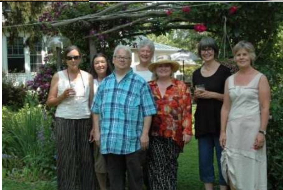
PEC Master Gardeners