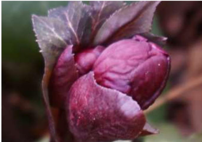
Newsletter of the Master Gardeners of Ontario